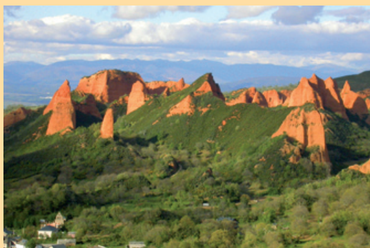
The Roman gold mining landscape, Las Médulas (León, Spain).

A27 'LANDMARKS' (2004-2008) was a transnational COST Action uniting 21 European countries. Researchers from many disciplines including history, archaeology, literature, environmental studies, geology, biology, geo-information, geography and mathematics were successfully brought together around a common theme, the effect on rural and mining landscapes of the cessation of traditional activities. On the one hand, these areas are understood as inherited landscapes, they form a synthesis of historical processes; on the other, they offer possibilities for future change and development, with 'landscape as heritage' facilitating their integration into 21 st century social and economic realities.