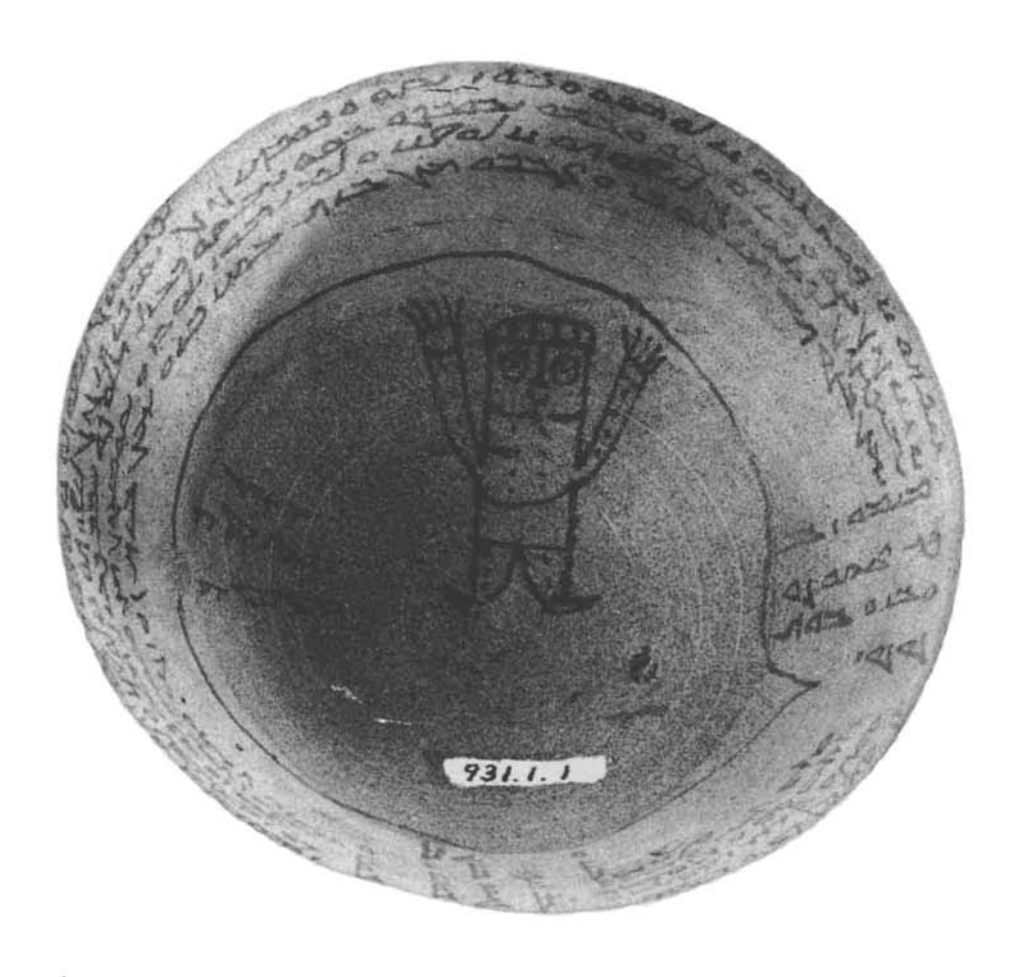
PLATE V: Harvard Semitic Museum 1931.1.1