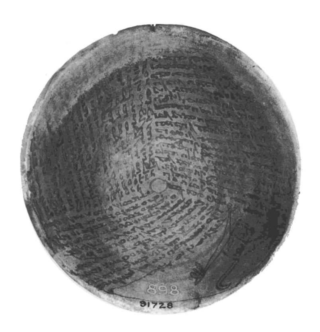
<u>PLATE II</u>: British Museum 91728.