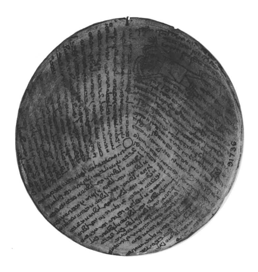
PLATE III: British Museum 91736 (Courtesy Trustees of the British Museum).