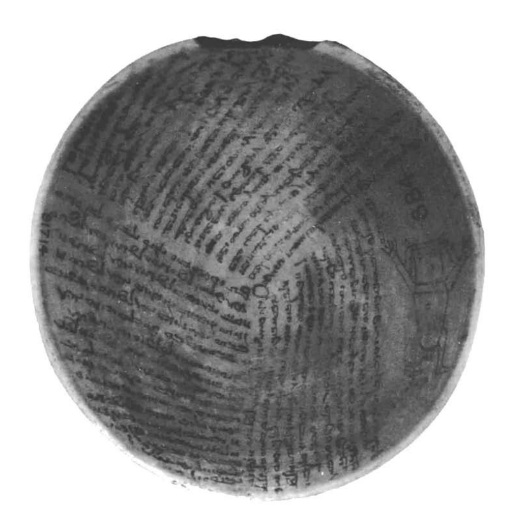
<u>PLATE I</u>: British Museum 91714.