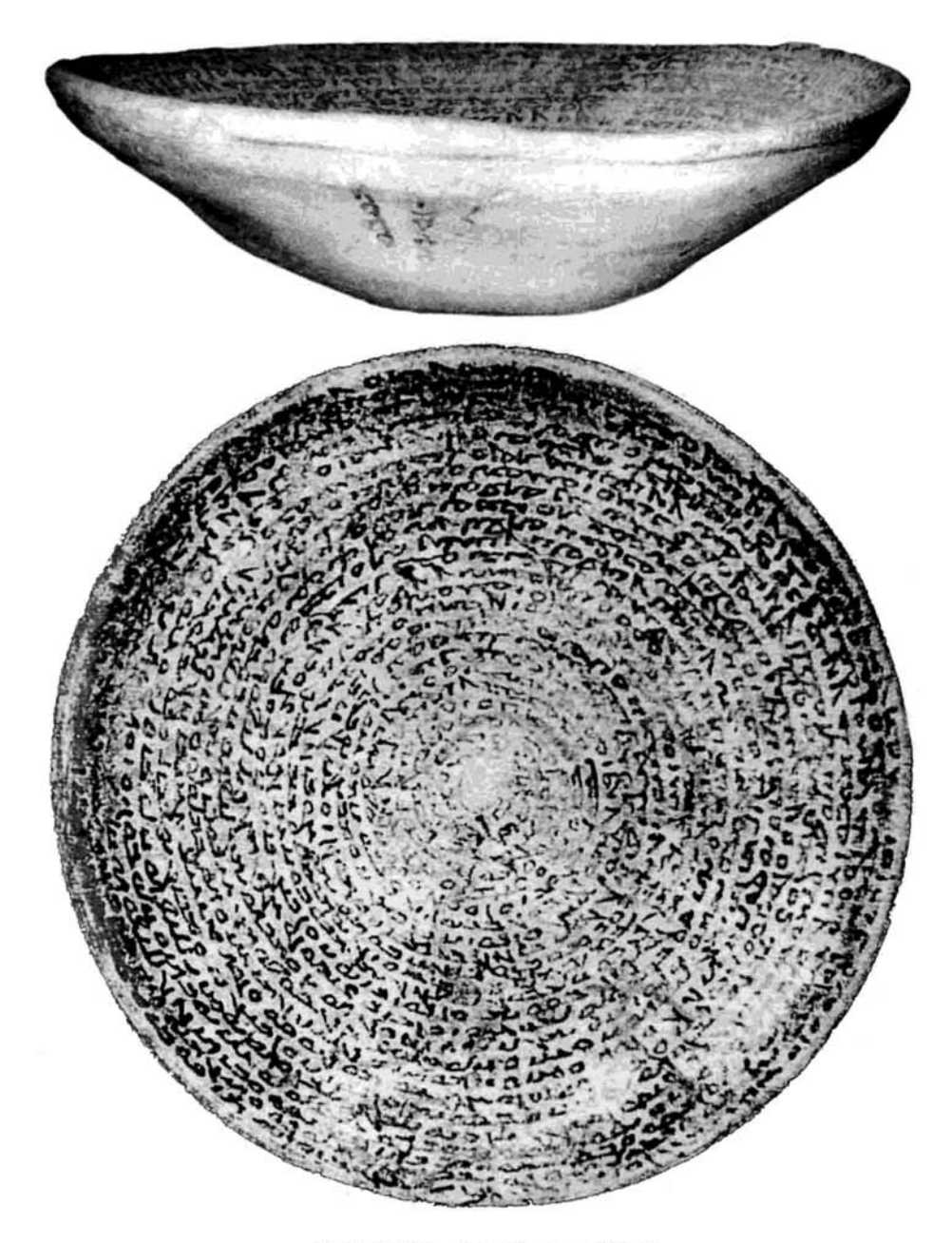
PLATE VII: Iraq Museum 60494