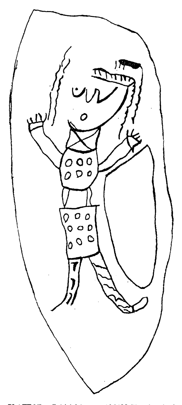
PLATE VI: British Museum 135438 (line drawing)